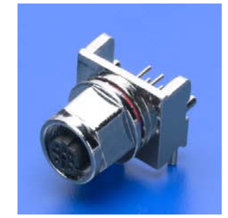
4-pole straight receptacle with O-Ring